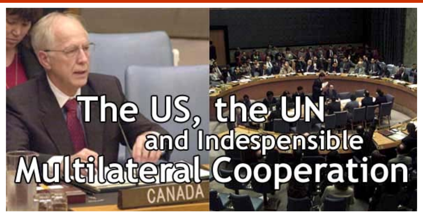
By Paul Heinbecker

This paper is meant to discuss two important and distinct but intersecting challenges to international stability and then propose some ideas for dealing with them. The first challenge is micro-political, more specifically, American exceptionalism, and the consequent uses and misuses of power. The second challenge is macro-political, specifically the diplomatic sclerosis of the United Nations, and other multilateral organizations, and their tendency towards inertia in the face of change. Each of these challenges is difficult and the context in which they intersect is potentially a very dangerous one.